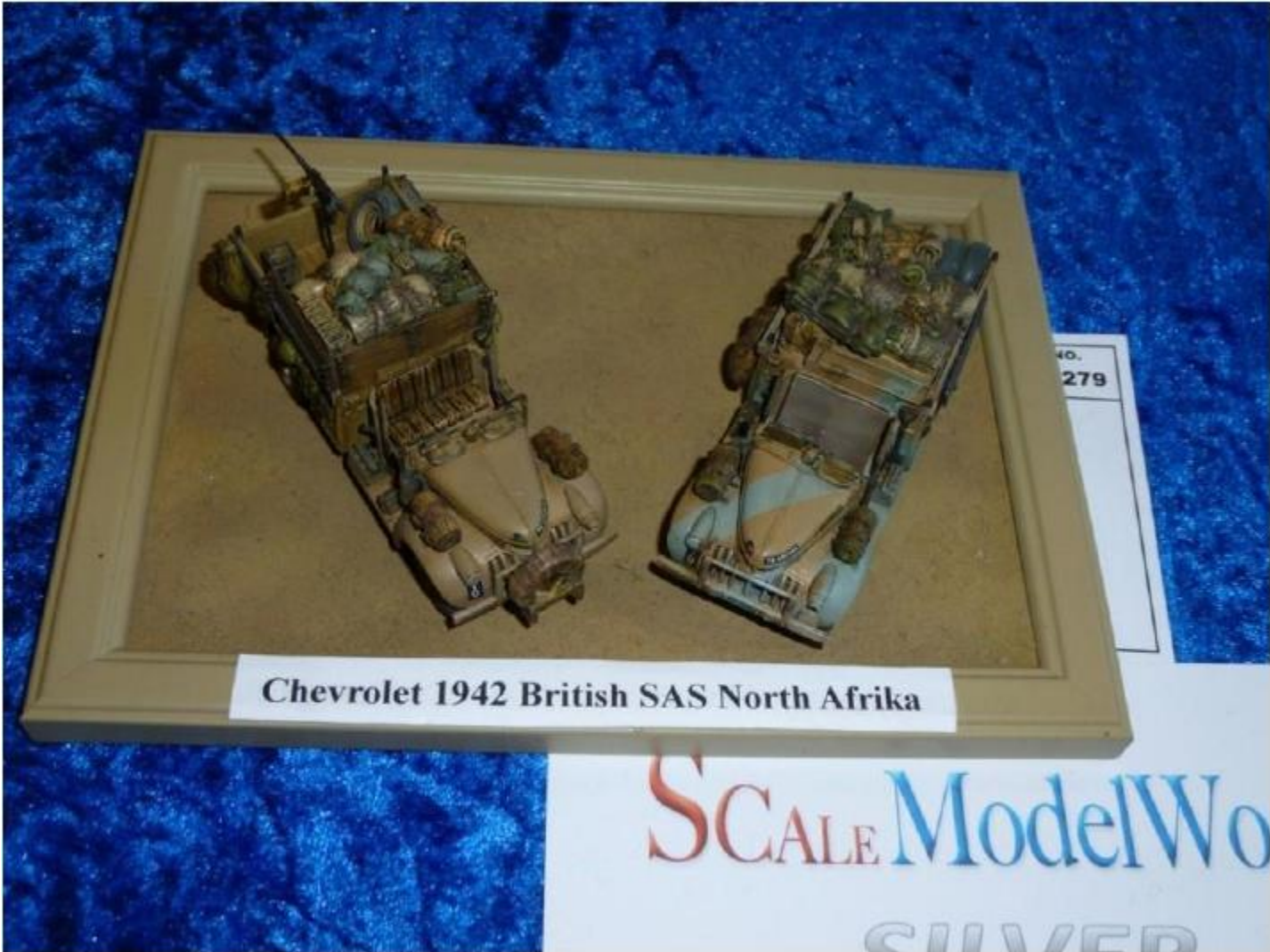
Chevrolet 1942 British SAS North Afrika